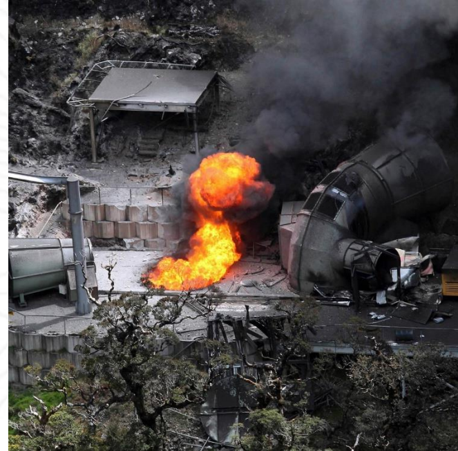
Pike River Mine, Nov 2010 29 dead

You manage what you measure -Safety stats can be an illusion