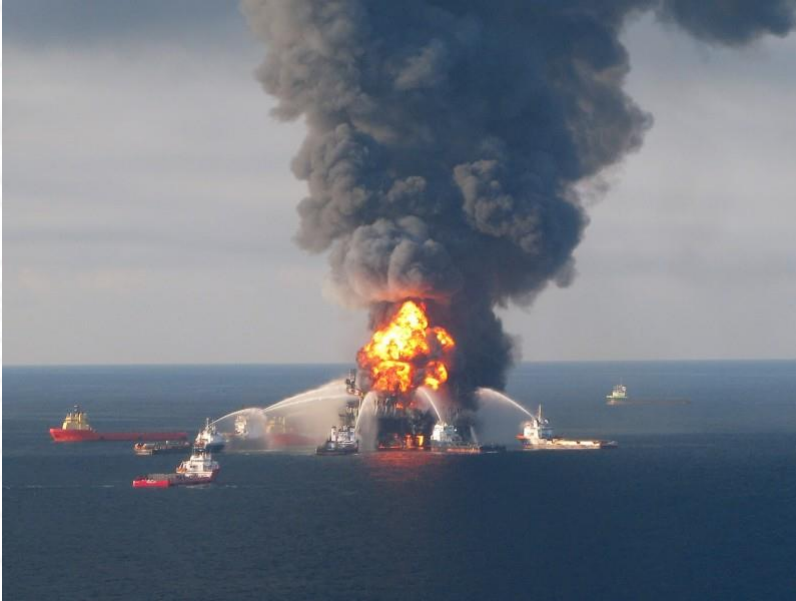
Deepwater Horizon, April 2010 11 dead