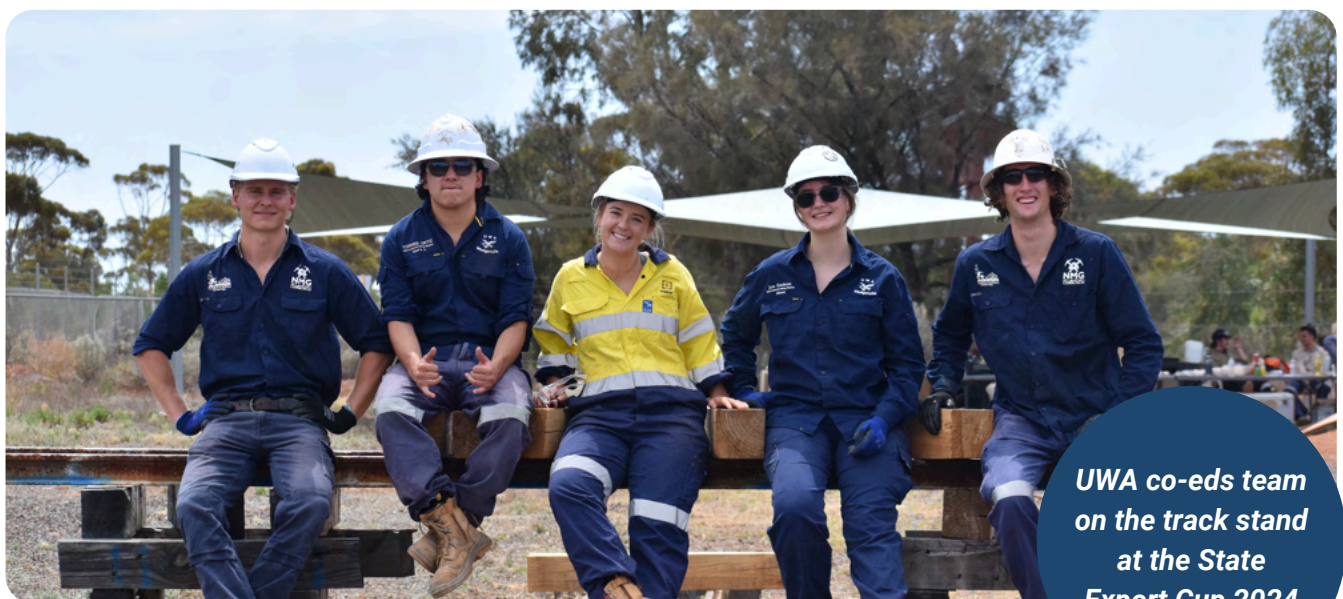
UWA co-eds team on the track stand at the State Export Cup 2024

The National Mining Games has grown significantly over the years. In 2025, the UWA, Curtin, and Kalgoorlie Student Chapters will host the Australian Pacific (APAC) Mining Games in Perth . Together, they look forward to garnering support to make this a memorable event for all Student Chapters across the APAC region.