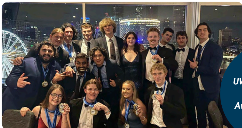
UWA Wedgetails at the 2024 NMG Awards Ceremony