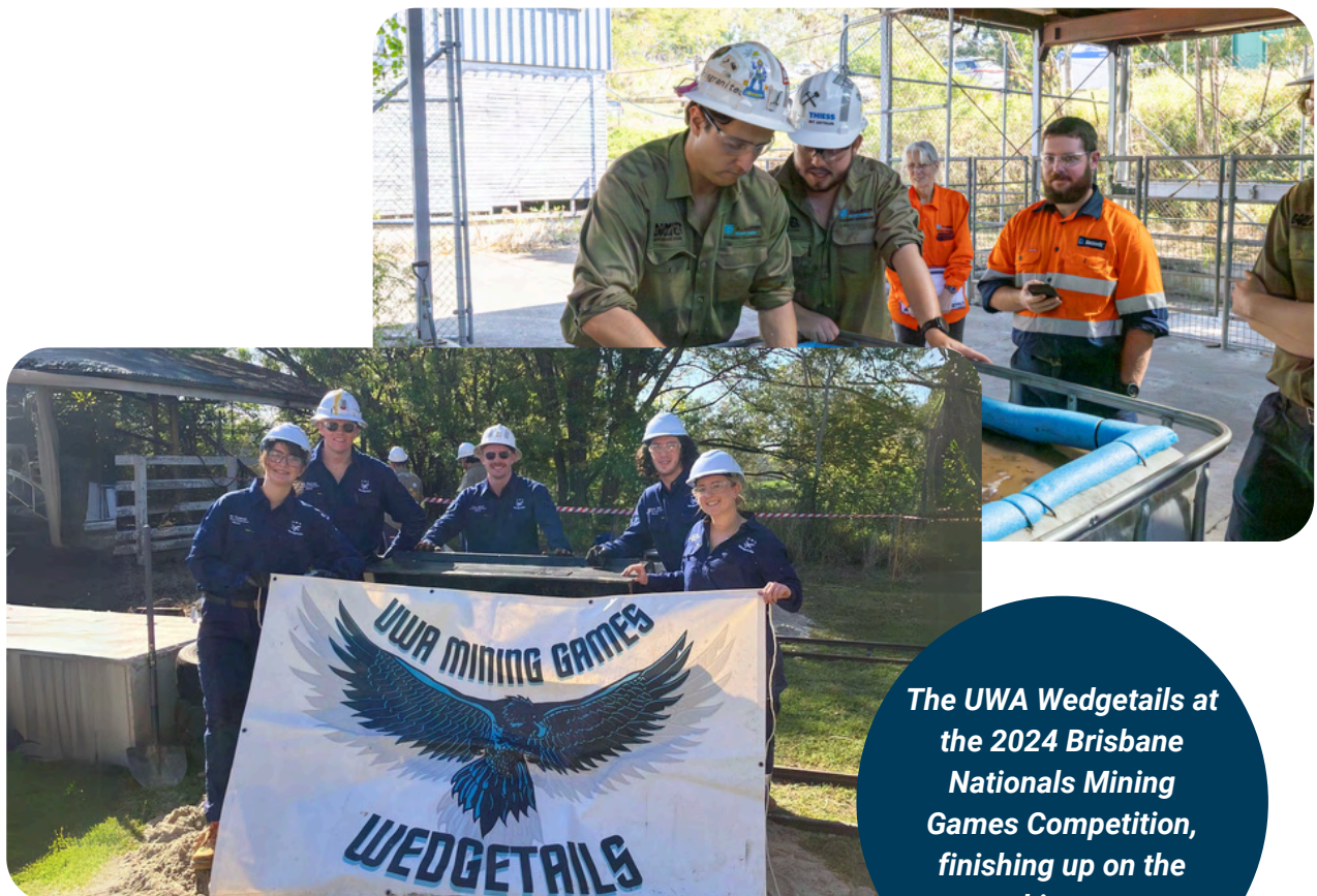
The UWA Wedgetails at the 2024 Brisbane Nationals Mining Games Competition, finishing up on the mucking event

All sponsorship packages are detailed on the following pages and are exclusive of GST.