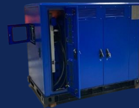
Portable Recovery Solution