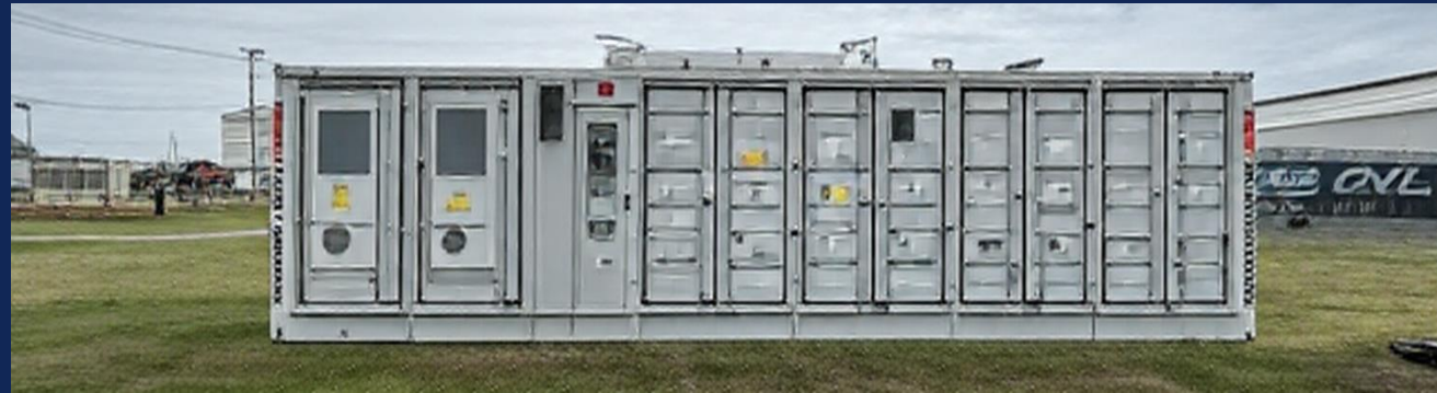
Containerised Fast EV Charging Station